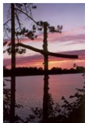
Outdoor Worship area