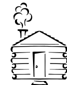
Emmaus #1 / #2