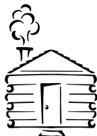
Babylon Staff Cabin