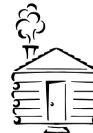
Damascus Health Center